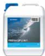
Fresh Up (Dr. Schutz)