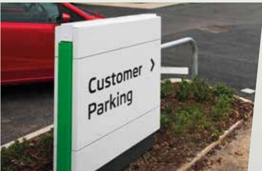
Small Directional Pylon