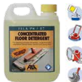
Fila Ps 87