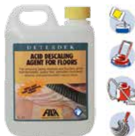
Deterdek 1:5 – 40 m 2